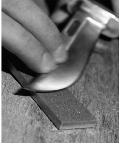
IRON SHARPENS IRON PROVERBS 27:17

The purpose of the Men's Ministry of the St. John Missionary Baptist Church is to provide relevant biblical principles and teachings to help men become the powerful men that God has created them to be.